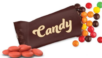
Pain Relievers or Chocolate Candies