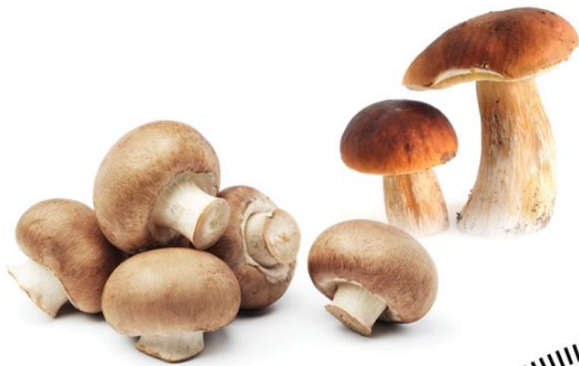
Poisonous Mushrooms or Edible Mushrooms