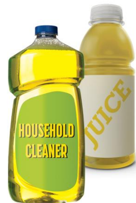
Cleaning Supply or Juice