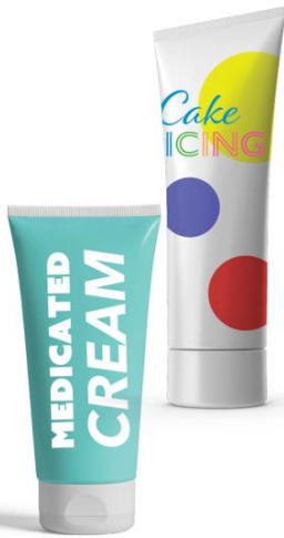
Medical Cream or Cake Icing

If you can't tell the difference, how can a child?